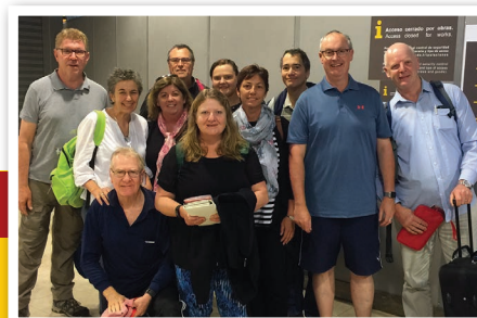
Camino group 2016