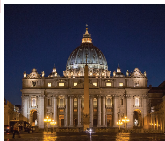
St Peter's Basilica, Vatican City