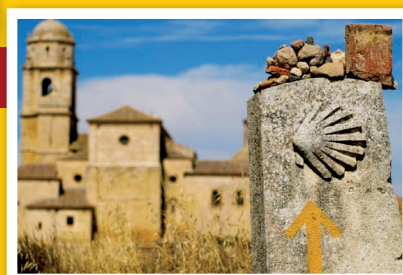
The scallop shell (symbol of St James) on the Camino Walk