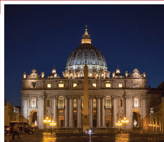
St Peter's Basilica, Vatican City